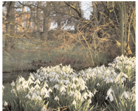
Snowdrops at Rode Hall